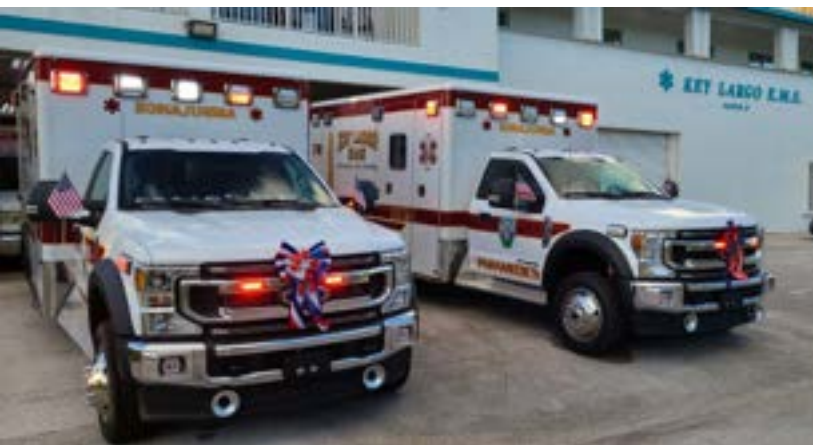
Bottom Photo: Rescue 23 & 123 Prepared for the 4th of July Parade