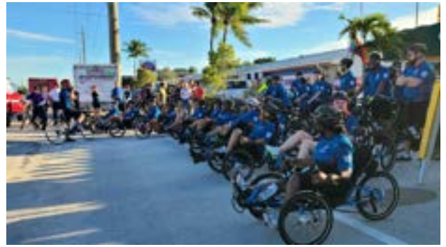
Top: Wounded Warrior Soldier Ride