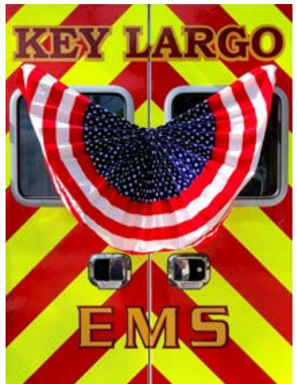
Back of Truck during 4th of July Parade